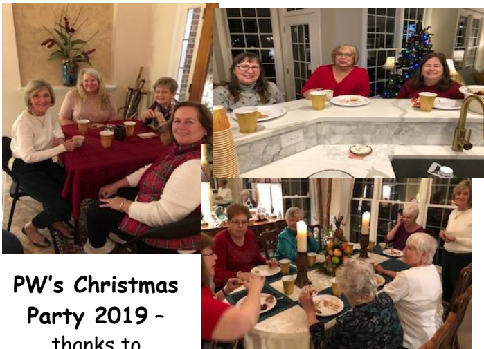
PW's Christmas Party 2019 - thanks to

The Session has called for a CONGREGATIONAL MEETING on Sunday, January 5, 2020, for the purpose of voting on a Minister for Cook's Memorial Presbyterian Church.